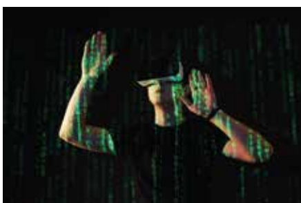
Hackathons & innovation sprints