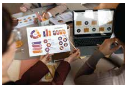
Strategy, product, marketing, & analytics challenges