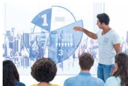
Pitch days & demo showcases