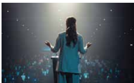
Guest talks, panels, and fireside chats with founders, CXOs, & senior leaders