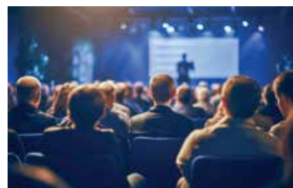
Curated access to industry conferences, meetups, & ecosystem events

These experiences expose students to real expectations, real pressure, & real standards — long before placements begin.