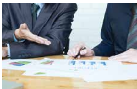
Business & case competitions

Students actively participate in a wide range of events that sharpen skills & expand professional networks: