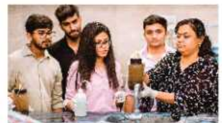
Material Testing Laboratory