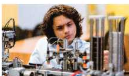
Bosch Mechatronics & Robotics Lab