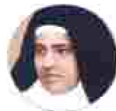
Mother Teresa of Calcutta (1927 - 1997)