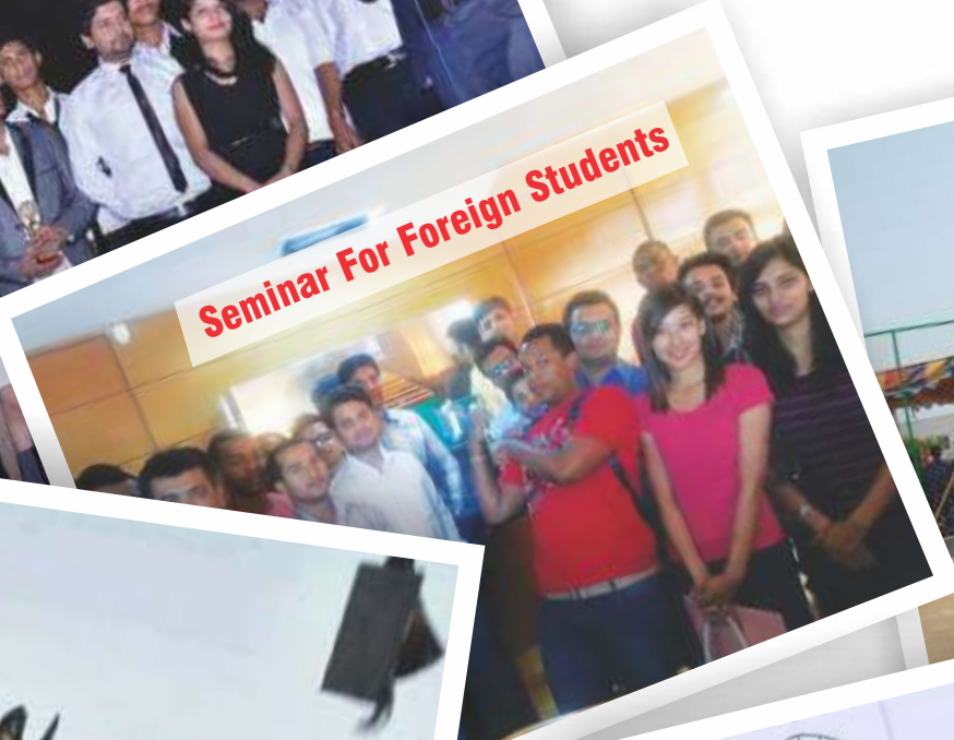
Seminar For Foreign Students