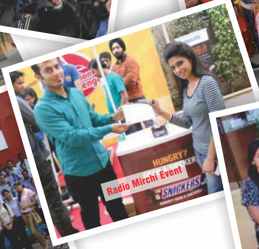
Radio Mirchi Event