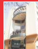
IBMR Campus Hubli