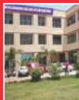
IBMR Delhi NCR Campus

CRC : D-7, Infocity-2, Sector-33, Near Hero Honda Chowk Gurgaon-122001. (Delhi NCR), Haryana (INDIA) Mobile: 09313280833, 09313209395 Landline : 0124-2370833, 2371833 Email: mba.gurgaon@ibmrbschool.org www.ibmrbschool.com