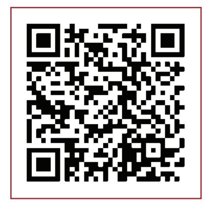
Visit us on