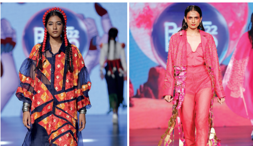
Student work showcase at Portfolio, 2022