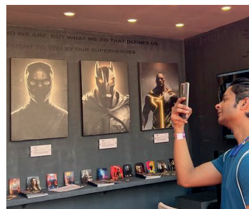
Comic Con Delhi, 2022