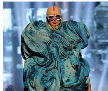
Student work showcase at FDCI x Lakme Fashion Week