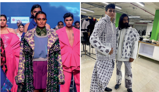
Pearl Academy x Graduate Fashion Week International 2022