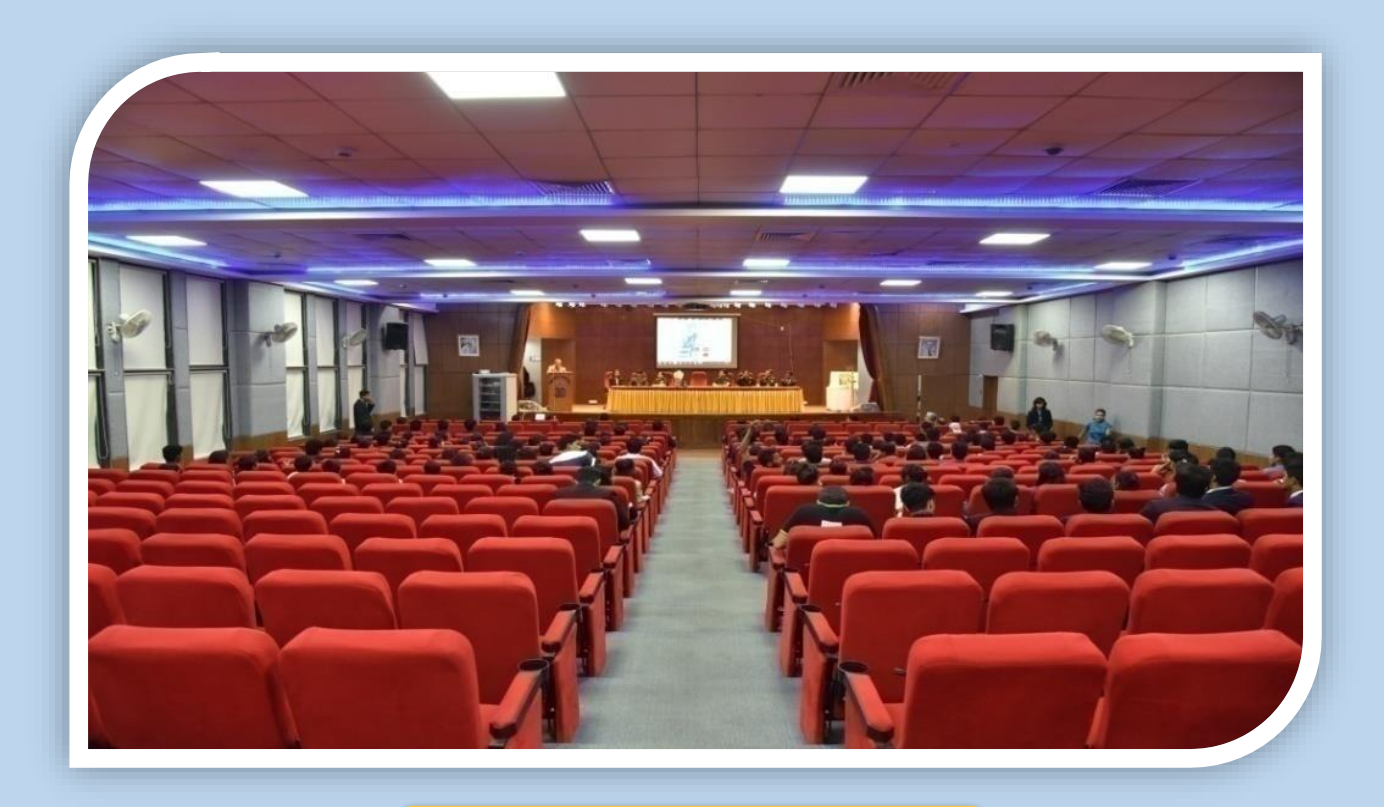
State of art Auditorium