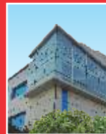
IBMR Campus Gurgaon