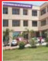
IBMR Delhi NCR Campus