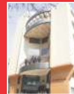
IBMR Campus Hubli