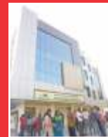
IBMR Campus Ahmedabad