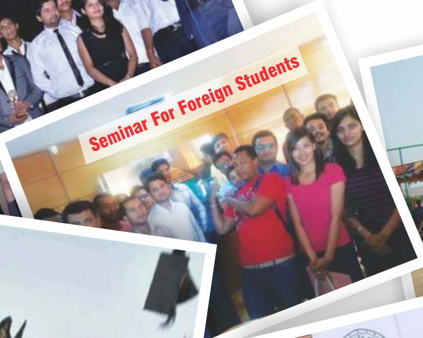
Seminar For Foreign Students