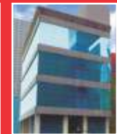
IBMR Campus Bangalore