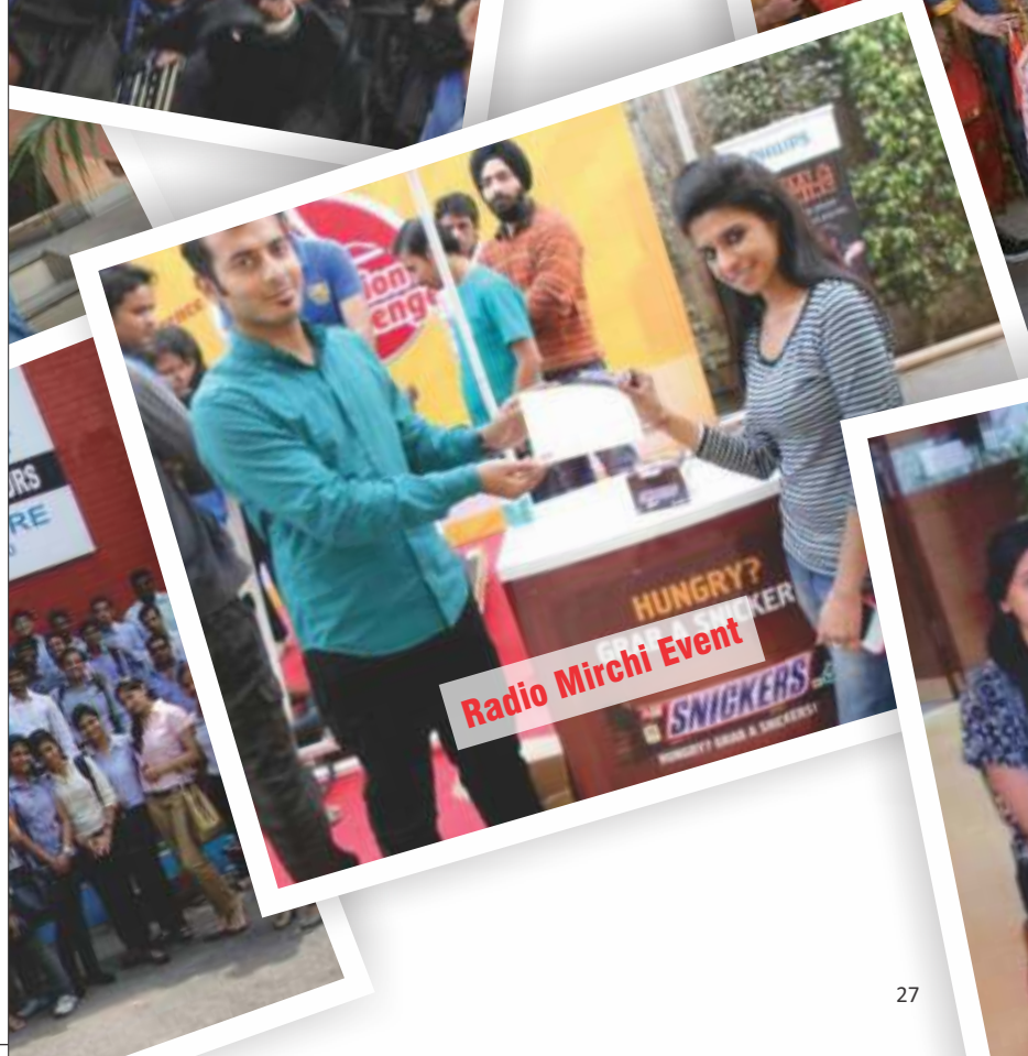
Radio Mirchi Event